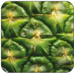
Superb dry spotting control on fruit treated with Sta-Fresh® 2952