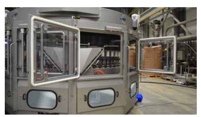
Mechanically and electrically locked side doors for easy access to the filling area of a Ultra Clean Precifill™