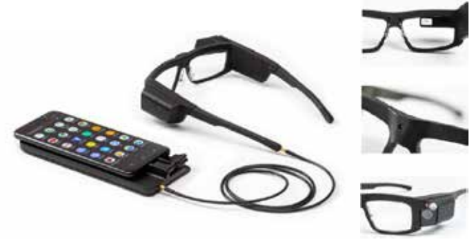
Lightweight & Certified Safety glasses.

Smart glasses for "hands free" service; communication through audio and head-mounted bidirectional video.