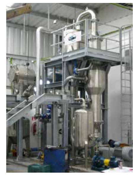
Hot Break/Cold Break