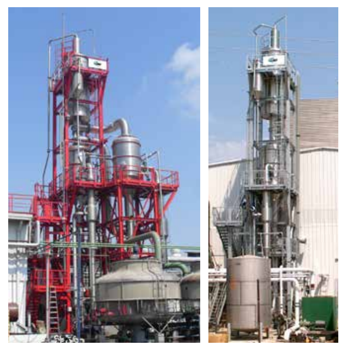
Double Effects and Single Effect Evaporator