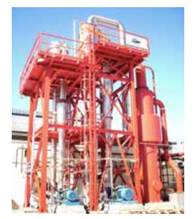
Compact Hot Break enzyme inactivator and TFCE 1E-1S-3 Evaporator