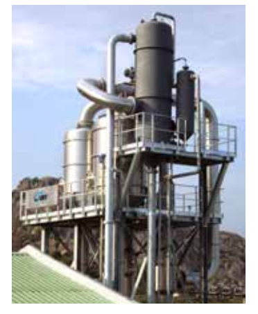
Evaporator TFCE 2E 2S - 5

The evaporator operates under vacuum which is maintained by a condenser connected to the evaporator's last effect and to a vacuum pump. Machine operations, including start-up and shut-down, are controlled by PC/PLC system; operator's intervention is consequently limited to menu's selection.