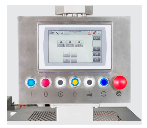
The controls and product adjustments are managed by the Human Machine Interface (HMI).

The TN2004 has been reengineered from the ground up. Fabricated sheet metal frame work means no closed tubing and provides open access to all surfaces while all horizontal