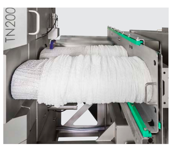
Auto Chute Change: Chute changes in 3 seconds are possible.

The all new auto chute change system is a game changing automation innovation. The auto chute change automatically indexes the empty chute to the buffer and the full chute to the run position for the fastest changes possible, Chute changes in 3 seconds are possible. The empty chute can be removed at any time and a new full chute added all without interrupting production. This means better utilized equipment, less pressure on employees, and higher productivity. The innovative internal funnel means that the chutes are simpler, more robust and best of all, longer, allowing for even better run time between chute changes and even less wasted netting.