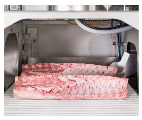
TN2004 completely automates the process of netting and clipping products like large bone-in hams, small briskets, even bone in loins

surfaces are kept to a minimum by using angles to prevent pooling of water. Continuous welds and the use of standoffs to prevent surfaces from being in contact all result in a machine that provides a very easy to sanitize and hygienic solution.