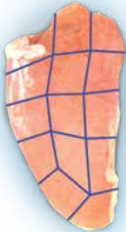
Nuggets with shape control

Cutting Strategies tailored for every single piece