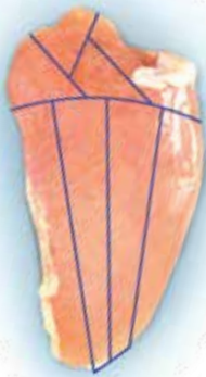
Combination strips with nuggets