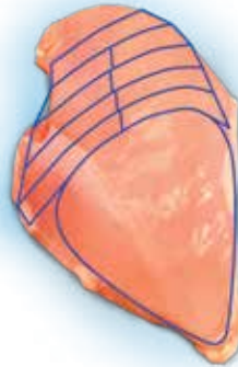
Short strips with portion