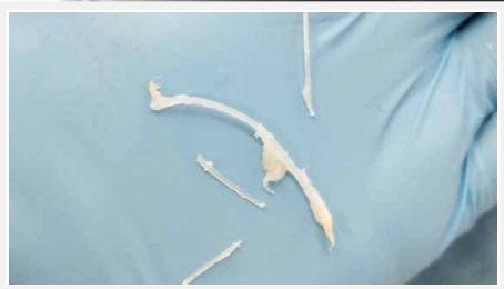
During manual or automatic bone removal, a certain percentage of bone fragments will remain present in the fish product.