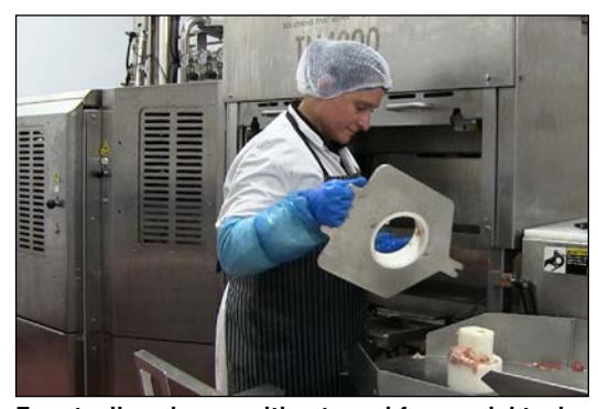
Easy tooling change without need for special tools.

"To be able to reproduce time and time again is fantastic."