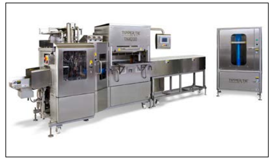
TN4200 with RCB rucker.

The physically demanding manual handling has been eliminated. A single operator places the ham sections into the five inch diameter breech and the machine takes over from there, compressing the ham into consistent lengths and diameters