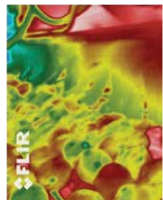
Thermal image of fruit exiting a dryer equipped with a Smart Dryer System, showing uniform temperature and heat distribution