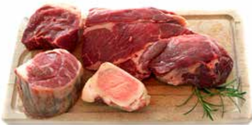
Avure's HPP processing inactivates pathogens, extends shelf life.

JBT-Avure operates an in-house HPP foods applications center in Erlanger, Kentucky, USA to help partners perfect their products, formulas, and packaging. Additionally, we partner with several HPP certified laboratories worldwide to facilitate HPP product process optimization and regulatory requirements. JBT-Avure has an extensive library of process- and package-validated studies conducted for regulatory approval which are available for clients considering HPP technology.