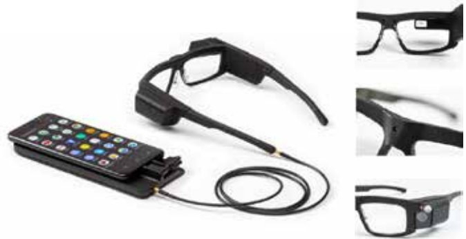
Lightweight & Certified Safety glasses.

Smart glasses for “hands free” service; communication through audio and head-mounted bidirectional video.