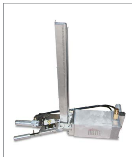
Model F625LM for left-handed operation.