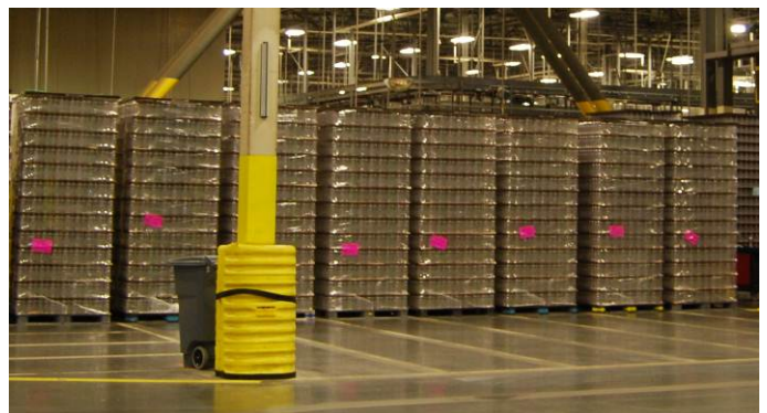
SGV automatically unloads a trailer with empty bottles and delivers them to the filling lines.