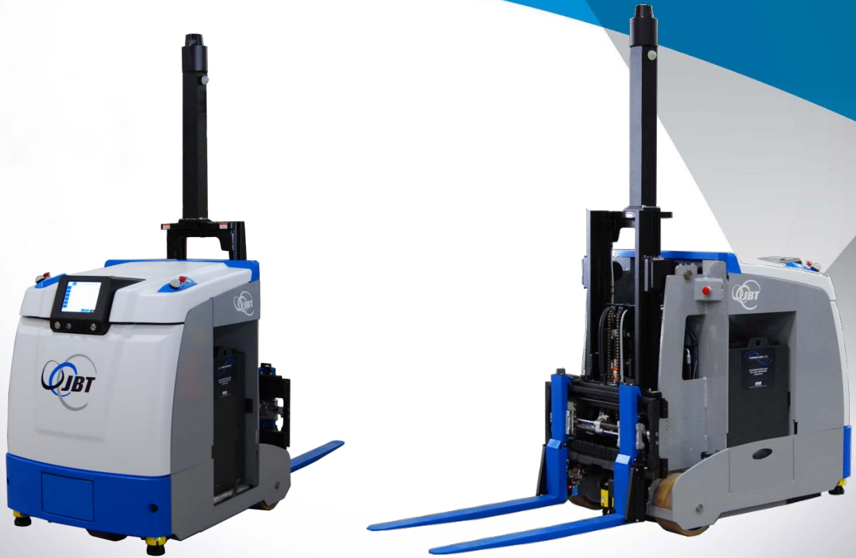
CB 1500 AGV