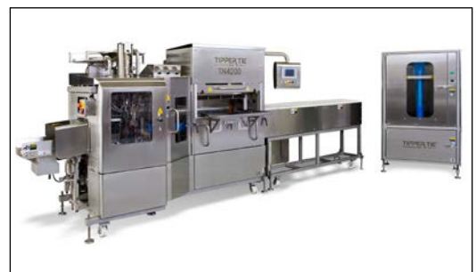
TN4200 with RCB rucker.