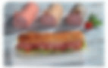
Die Fleischwarenindustrie hat in den letzten Jahren viele Neuerungen bei der Herstellung von Fleischwaren erlebt.

Die Fleischwarenindustrie hat in den letzten Jahren viele Neuerungen bei der Herstellung von Fleischwaren erlebt. Neben der Weiterentwicklung der Rezepturen und der Verarbeitungstechniken spielen auch die Verpackungslösungen eine wichtige Rolle. Ein Beispiel dafür sind die sogenannten Kochplättchen, die in der Gastronomie und im Einzelhandel immer beliebter werden. Diese Plättchen sind in der Regel aus Kunststoff oder Metall gefertigt und ermöglichen es, Fleischwaren in einer bestimmten Form und Größe zu präsentieren. Dies ist besonders für die Zubereitung von Sandwiches und Snacks geeignet. Die Verwendung von Kochplättchen hat auch Vorteile für die Hygiene und die Lebensdauer der Produkte. Durch die Verwendung von geeigneten Materialien und die Einhaltung von Hygienestandards können die Plättchen leicht zu reinigen und zu desinfizieren werden. Dies ist besonders wichtig, wenn sie für die Zubereitung von Fleischwaren verwendet werden. Die Verwendung von Kochplättchen ist auch eine Möglichkeit, die Präsentation der Produkte zu verbessern und sie attraktiver zu machen. Dies ist besonders für den Einzelhandel wichtig, um die Aufmerksamkeit der Kunden zu erregen. Insgesamt ist die Verwendung von Kochplättchen eine sinnvolle Investition für die Fleischwarenindustrie, um die Produktion von attraktiven und hygienischen Produkten zu ermöglichen.