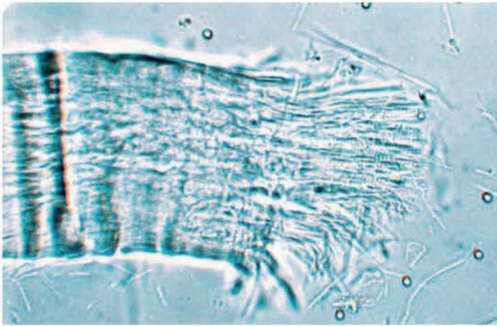
Fig. 3: Negative pressure ("vacuum") increases the swelling of the native muscle fiber due to the salt from the added brine, thus increasing the effect.

in the container is continuously below 50 mbar (less than 5% of the normal pressure or atmospheric pressure). The thermal plate used for cooling allows product temperatures of up to 1 °C during operation. Thanks to the 90% fill level, the product has a large, effective contact surface with the cooled vessel container wall. Due to the strong mixing action of the paddle, the temperature in the interior of the product is quickly and effectively reduced.